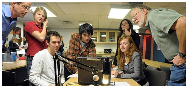
Teachers and students interact during an introductory astronomy class.

Teachers, did you know there is a space just for you on the newly redesigned Highlights for High School website?