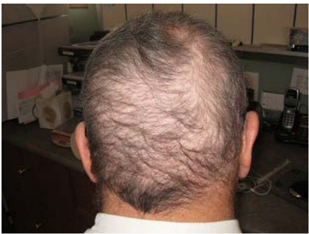
Hair loss affects millions of people.

In a <u>recent study</u>, published in the Proceedings of the National Academy of Sciences of the United States of America, scientists have reported a new method of generating human hair. These scientists have successfully grown human hair by manipulating cell culture conditions, cloned the cells in tissue culture, then grafted this new hair onto mice. The initial results show new hair growth that have lasted about six weeks.