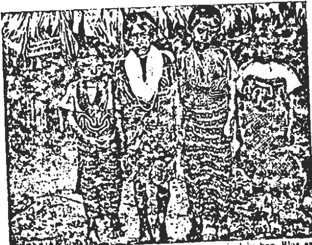
Beads for the legs. Dame Fashion is as tyrannical in Dan Blue as in other parts of the world.