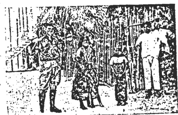
A Panamanian policeman with some native boys and girls. The steps to the new government public school are in the background.