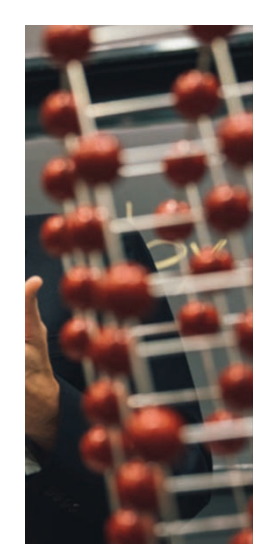
Figure 1: From November 18, 2016: Example of the physical chemical structure and black board writing.

At MIT, there are contrasts between known and unknown factors in experiments and