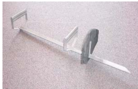
Figure 2. The D-handle pick prod.