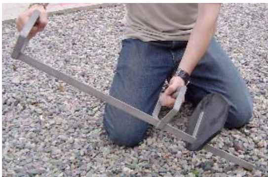
Figure 1. The MIT pick prod in use.

We incorporated several improvements to enhance safety, usability, comfort, production, and marketability. The body was changed from square steel to angle, which improves manufacturability in developing countries, allows us to increase the thickness for greater durability, and eliminates the safety hazard from a possible barrel effect. We also moved to a symmetric rubber shield, which improved product image and usability. The new handles retain the double tube grip, but are now oriented to allow easier swing and better angle of impact.