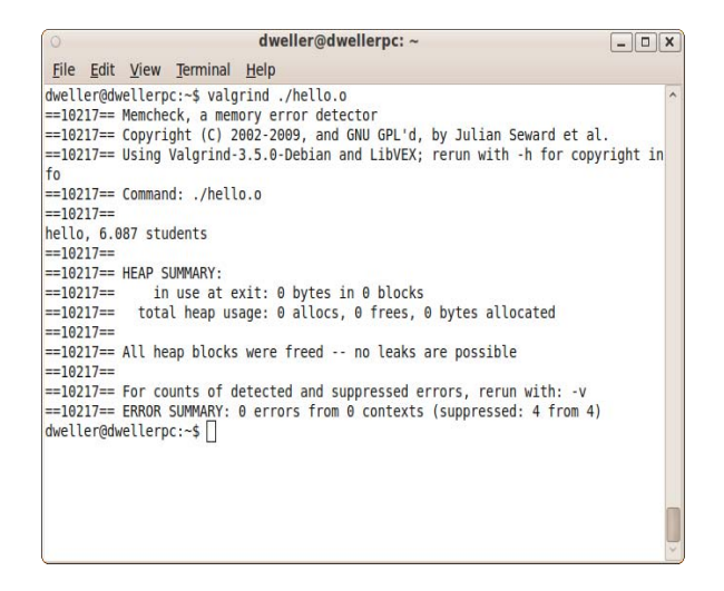
Figure: valgrind: diagnose memory-related problems