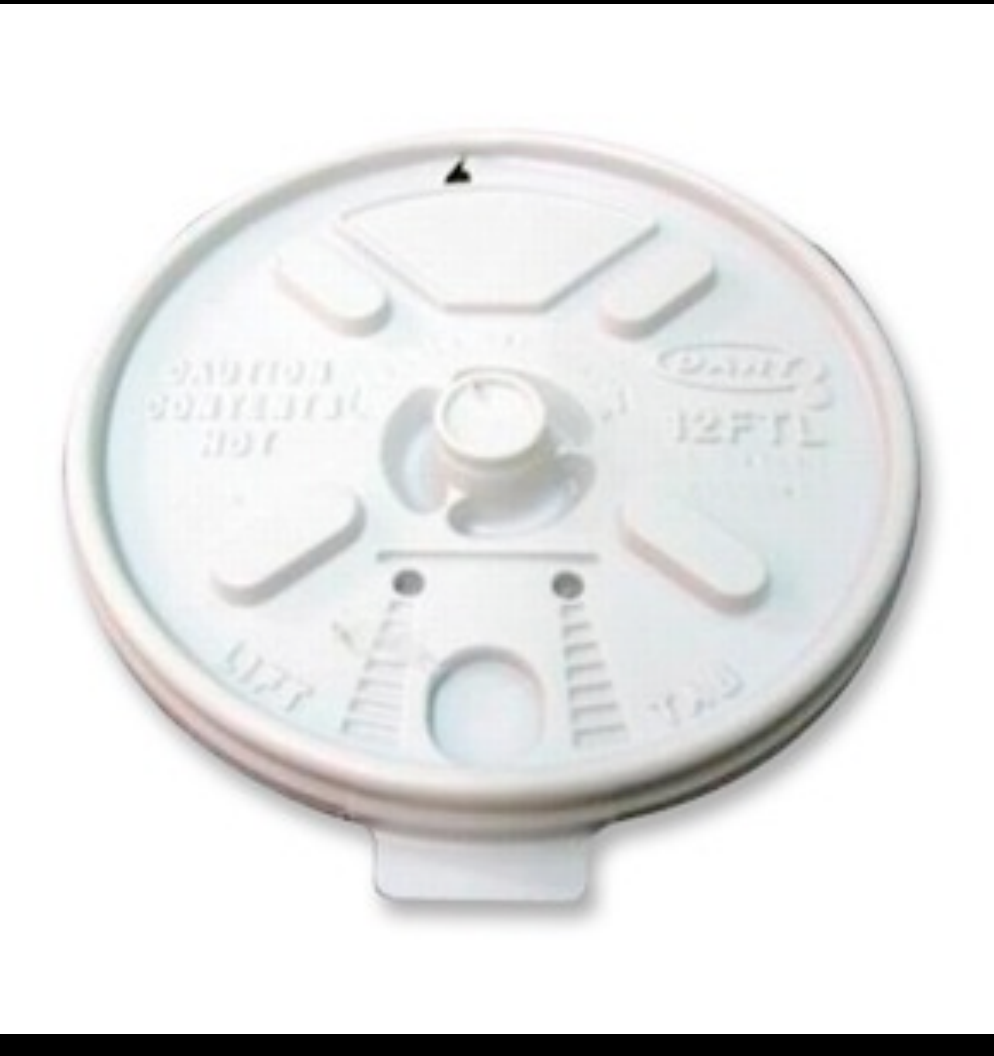
© source unknown. All rights reserved. This content is excluded from our Creative Commons license. For more information, see http://ocw.mit.edu/fairuse.