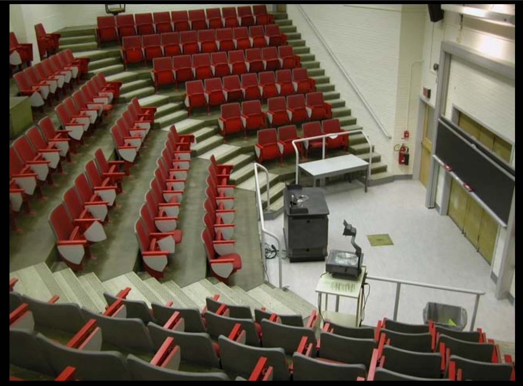
@ source unknown. All rights reserved. This content is excluded from our Creative Commons license. For more information, see <a href="http://ocw.mit.edu/fairuse">http://ocw.mit.edu/fairuse</a>.