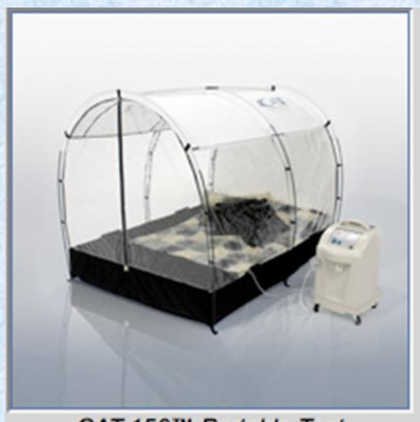
CAT-150™ Portable Tent

From their website: Lance Armstrong was fond of saying that he won the Tour in training. Besides the long miles, the mountain-based training camps, the carefully-weighed food, the guy was sleeping at altitude.