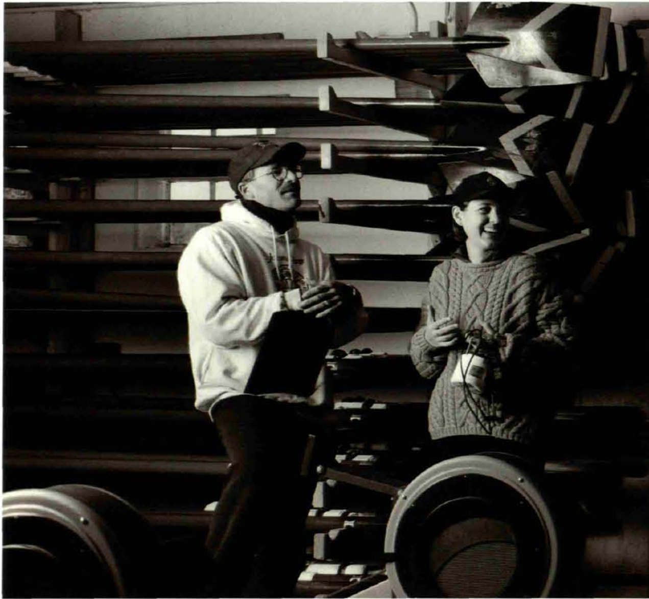
CREW IS JUST ONE OF THE MANY SPORTS AT ST. JOHN'S. THE ANNAPOLIS CAMPUS IS LOCATED ON COLLEGE CREEK AND THE BOATHOUSE IS THE PLACE TO GO FOR SAILING, CANOEING, AND CREW. ABOUT HALF OF ST. JOHN'S STUDENTS PARTICIPATE IN INTRAMURALS, WHICH INCLUDE SOCCER, FOOTBALL, BASKETBALL, AND VOLLEYBALL.