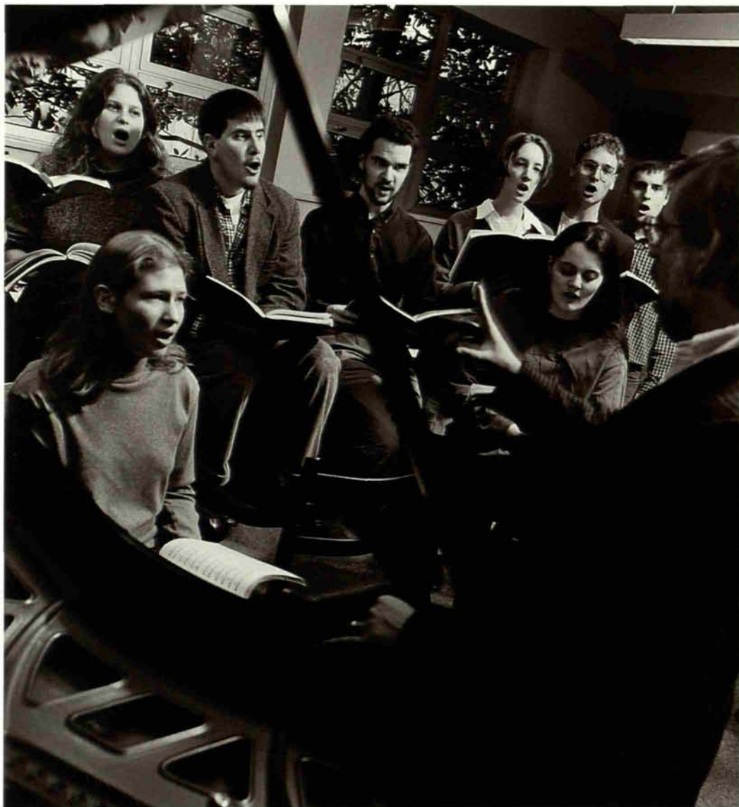
MANY STUDENTS PURSUE MUSICAL INTERESTS AT ST. JOHN'S. HERE THE CAMPUS MADRICAL GROUP PRACTICES FOR AN UPCOMING HOLIDAY SEASON CONCERT.