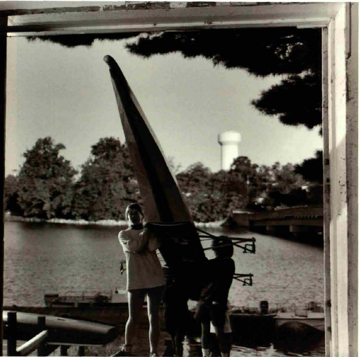
THE COLLEGE'S ATHLETIC FIELDS, TENNIS COURTS, AND GYMNASIUM ARE LOCATED ON THE 30-ACRE BACK CAMPUS, WHICH BORDERS COLLEGE CREEK. THE NAVAL ACADEMY, ST. JOHN'S ARCH CROQUET RIVAL, IS DOWN RIVER TO THE RIGHT (OUT OF PHOTOGRAPH).