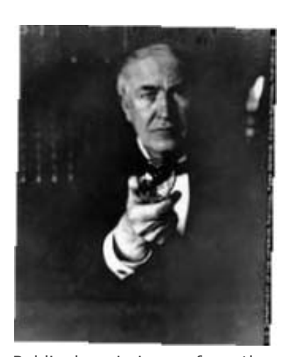
Public domain image from the U.S. National Park Service.