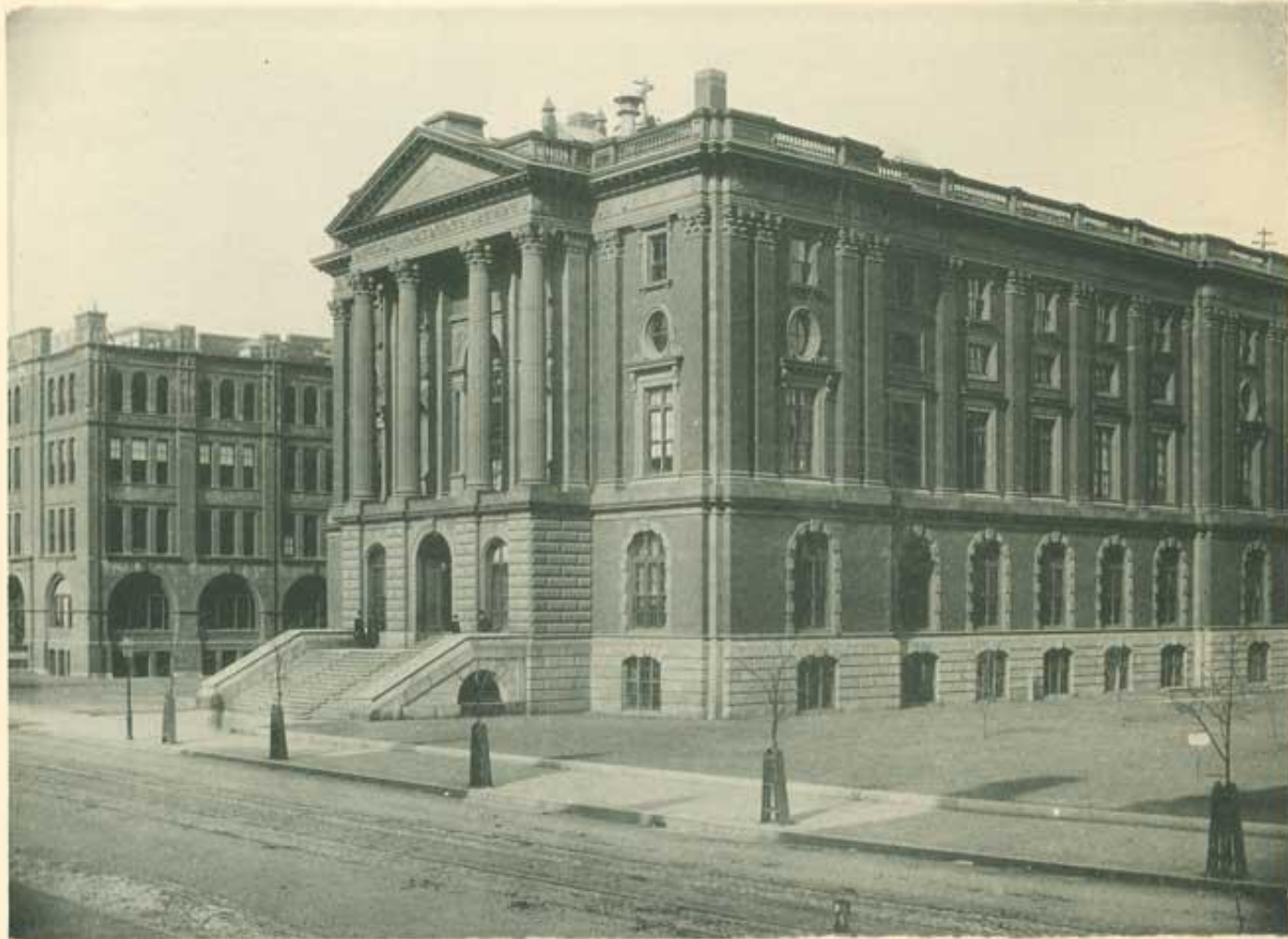
ROGERS AND NEW BUILDINGS.