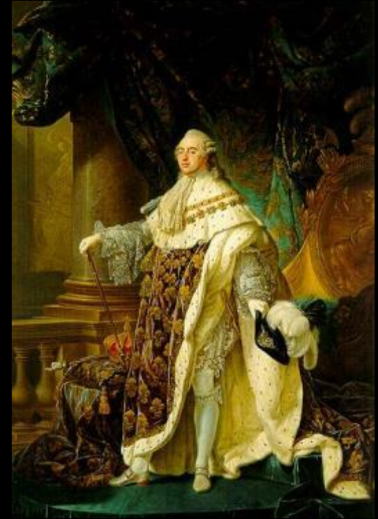
Louis XVI, 1774-1792