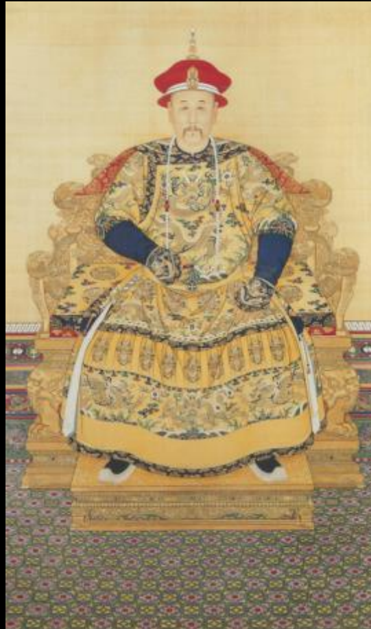
Yongzheng Emperor r. 1723-1735