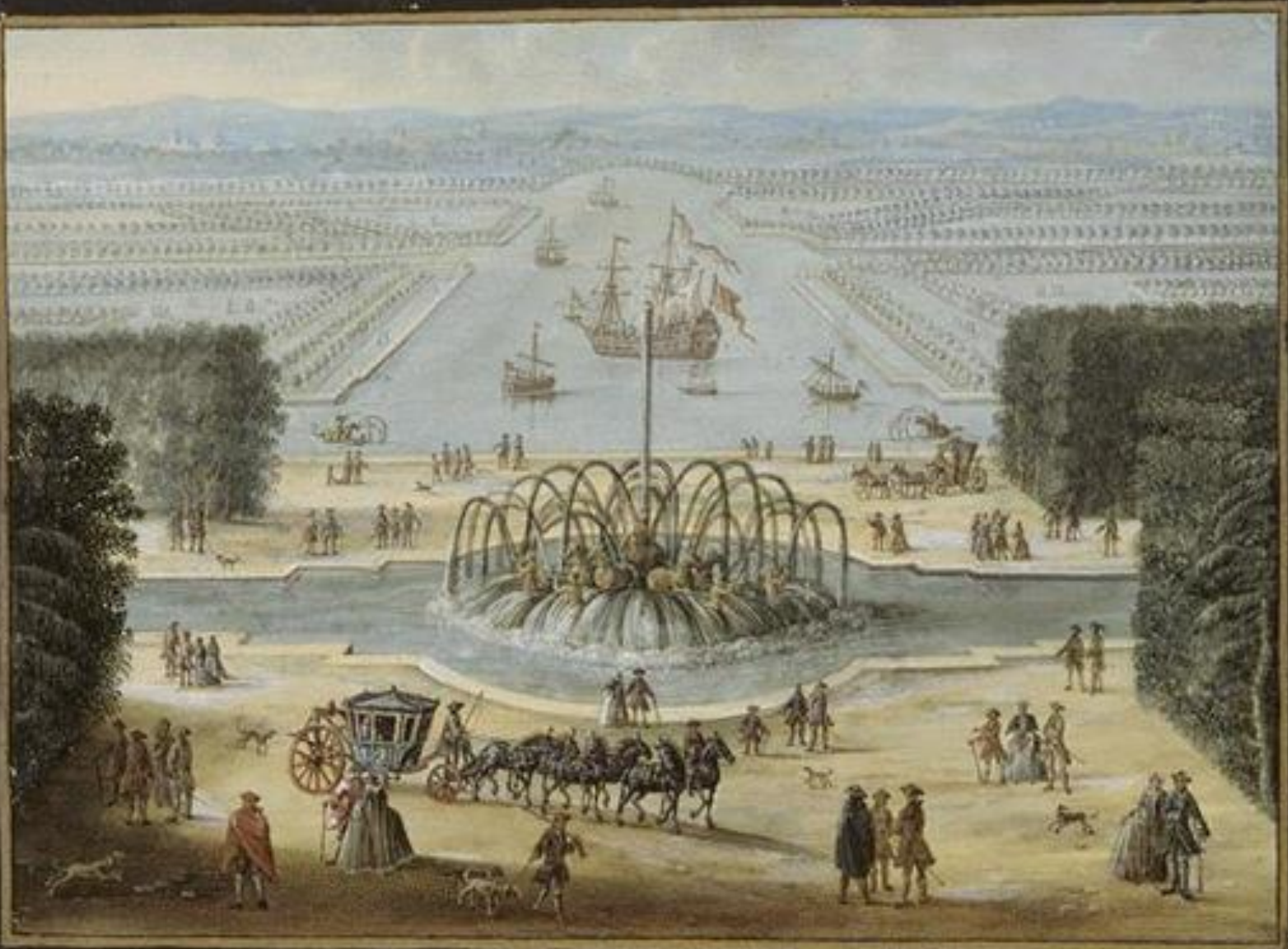
Le Bassin d'Apollon a Versailles.