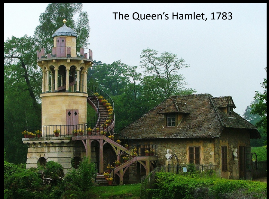
The Queen's Hamlet, 1783

Image courtesy of B on flickr. License CC BY-NC-SA.