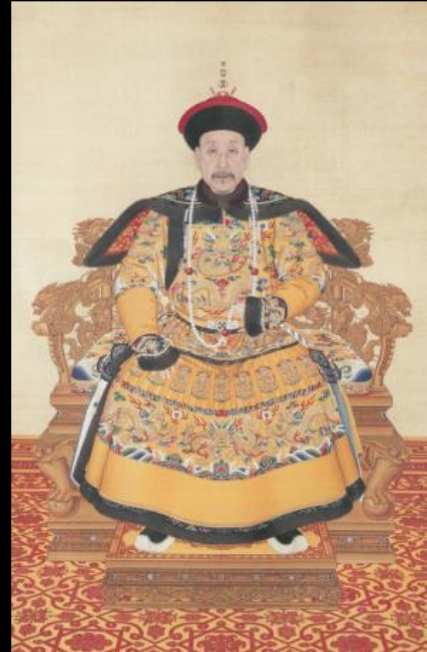
Qianlong Emperor r. 1735-1795