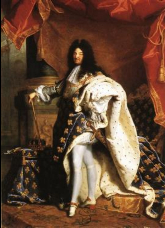
Louis XIV, 1643-1715