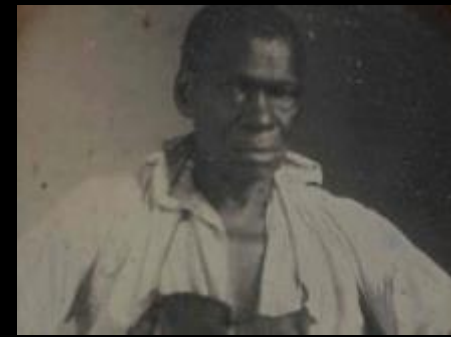
This image is in public domain.