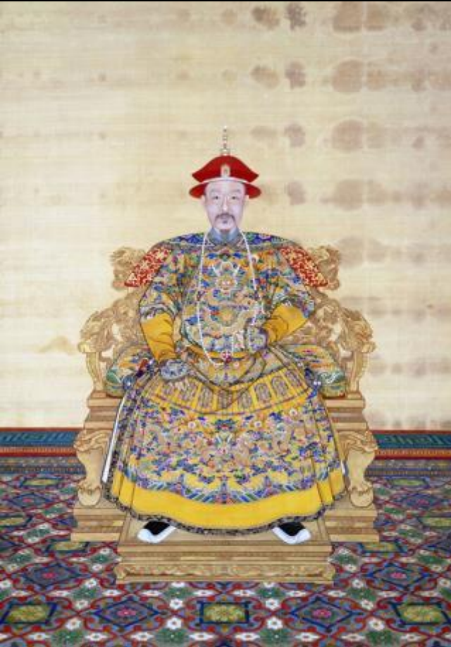
Kangxi Emperor r. 1662-1722