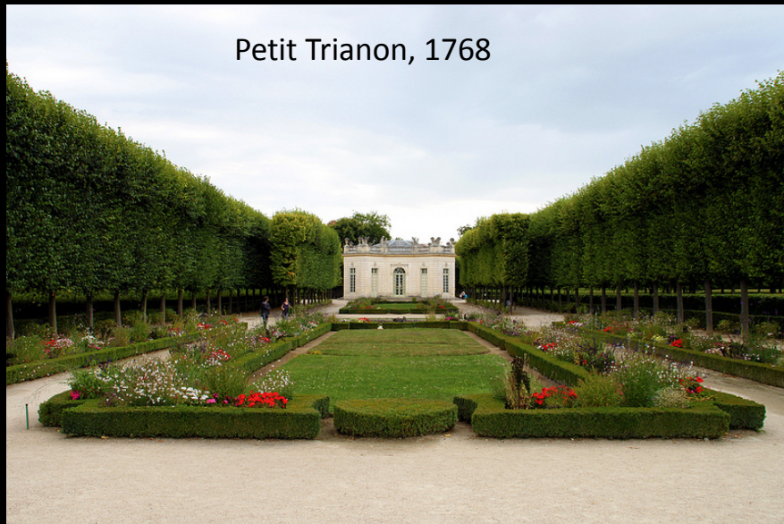
Petit Trianon, 1768