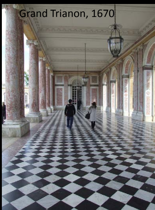
Grand Trianon, 1670