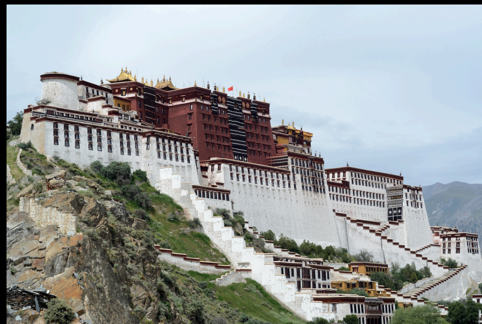
License CC BY-NC-SA.