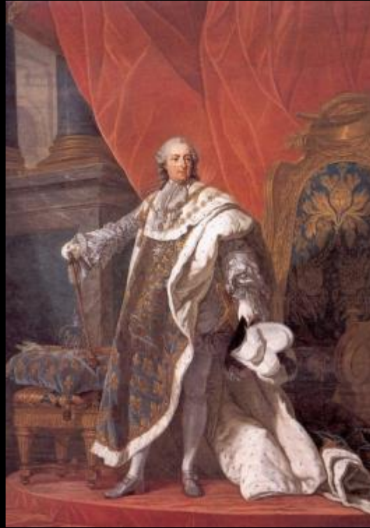
Louis XV, 1715-1774