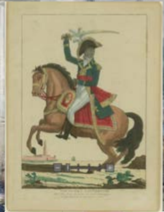
This image is in the public domain.