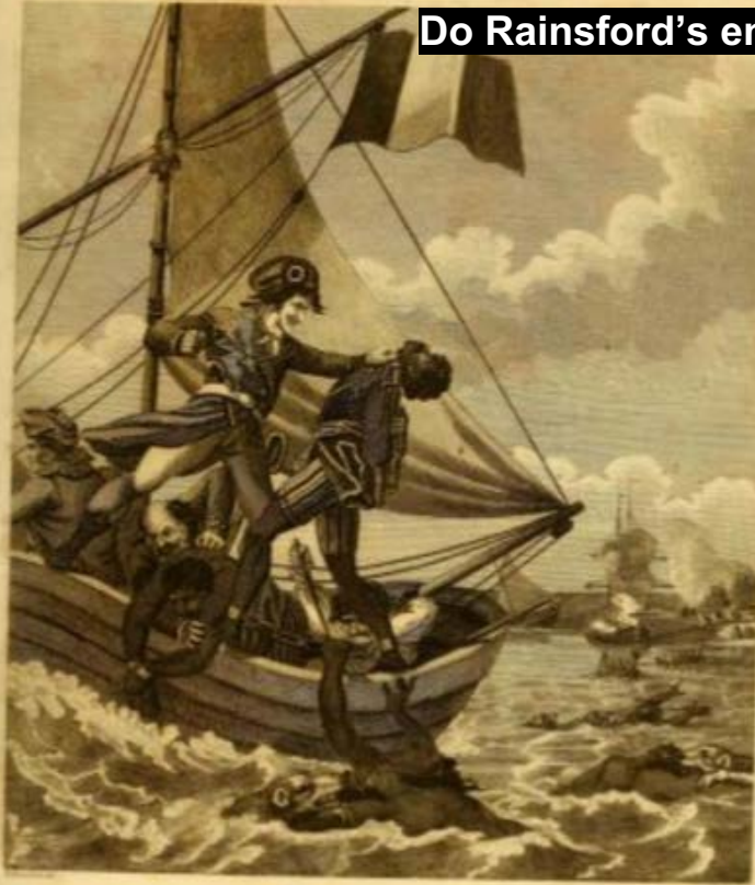
These threats of exterminating the Black Army are frustrated by the French.

Do Rainsford's engravings make a false moral equivalence?