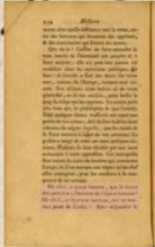
This image is in the public domain.

- Justifies differential treatment of men