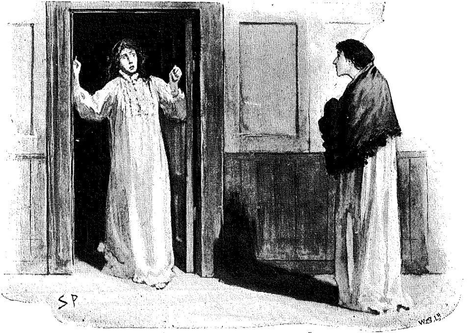
"HER FACE BLANCHED WITH TERROR."

"No, she was in her nightdress. In her right hand was found the charred stump of a match, and in her left a matchbox."