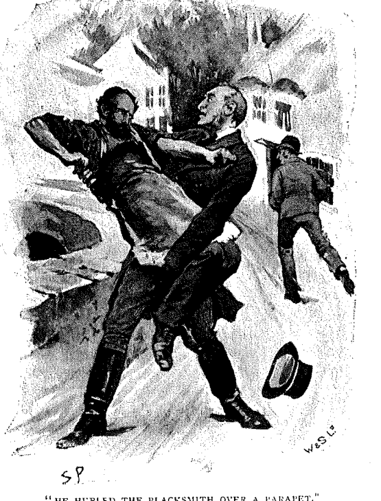
"HE HURLED THE BLACKSMITH OVER A PARAPET."

"Last week he hurled the local blacksmith over a parapet into a stream, and it was only by paying over all the money which I could gather together that I was able to avert another public exposure. He had no friends at all save the wandering gipsies, and he would give these vagabonds leave to encamp upon the few acres of