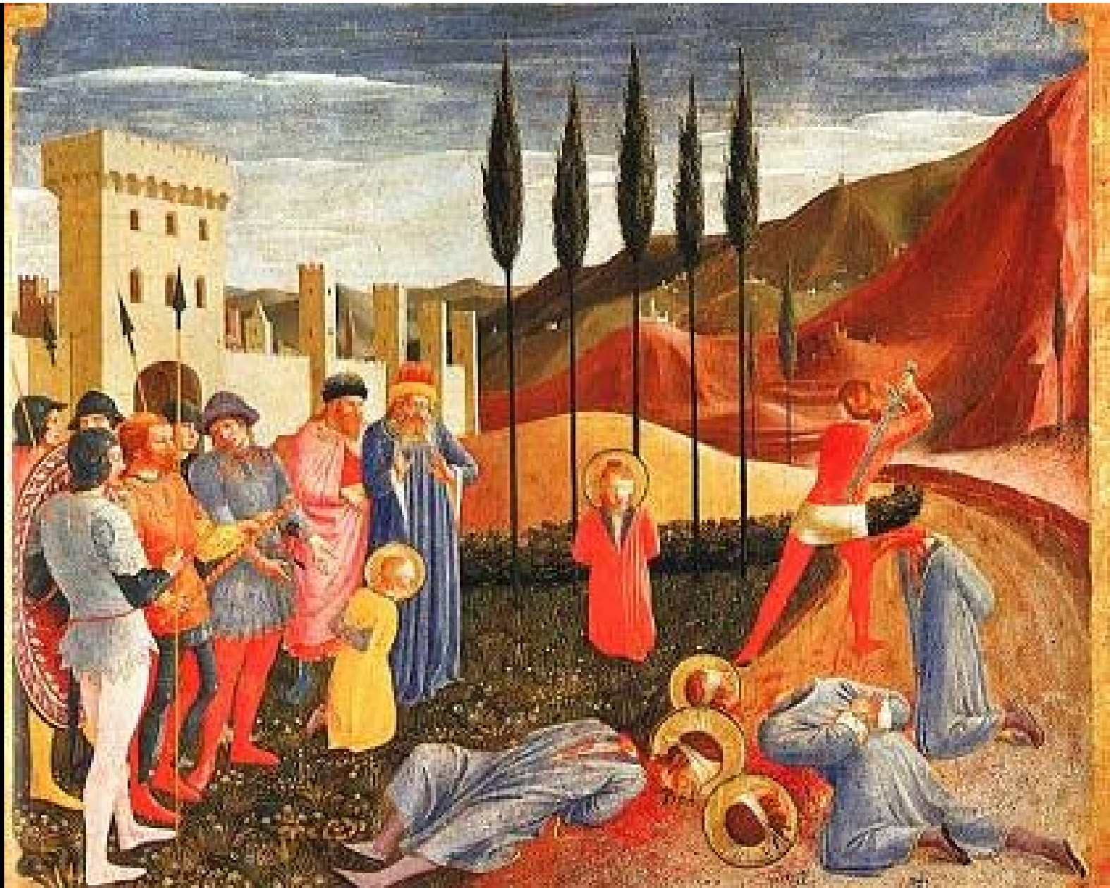
Cosmas and Damian having a bad hair day (by Fra Angelico)