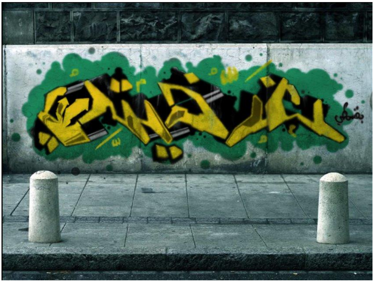
© Boksmati. All rights reserved. This content is excluded from our Creative Commons license. For more information, see http://ocw.mit.edu/help/faq-fair-use/.