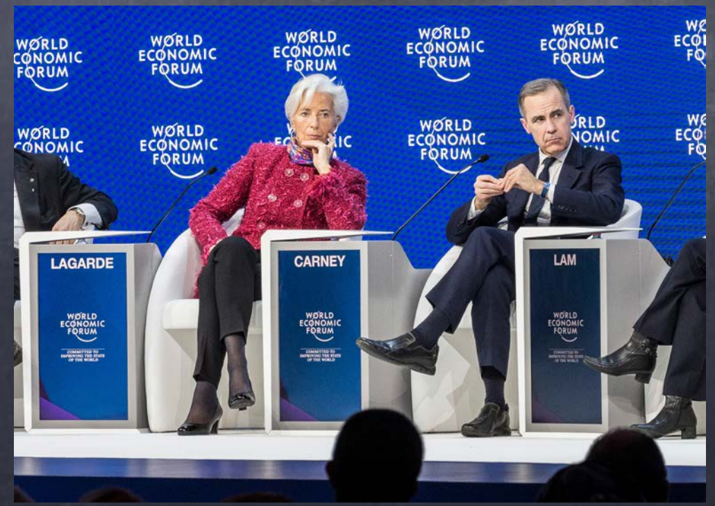
Image courtesy of World Economic Forum on flickr. License CC BY-NC-SA.