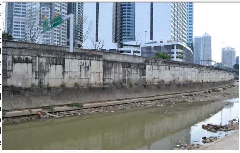
Figure 12.Current state of the river.

Johor Baharu and Kuala Lumpur are taking on the major task of restoring the rivers that run through the hearts of each city. They are doing this to improve the urban environment, improve livability for local residents, and revive a facet of their history that has been neglected as a result of rapid modernization and urban development. Implementing these projects involves collaboration between dozens of agencies and stakeholders, developers committed to the public good of the city, as well as a sustained effort to inform and educate the public on the importance of environmentalism and conservation. Comparing these two projects offers an opportunity for researchers to explore the similarities and differences in how river revitalization is implemented in the Malaysian context.