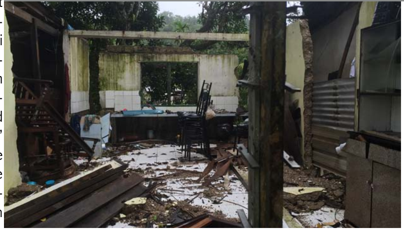
Figure 20.: Inside of abandoned home in former village near Bengoh Dam.

Those families who chose not to participate banded together to fight for their rights to the land. While enforcement is inconsistent, Malaysian courts have acknowledged historical claims to land, or Native Customary Rights, made by indigenous groups. The villages that resisted the resettlement plan found the legal support they needed to file suit in court to validate their land claims. The villages, led by Kampung Rejoi, won the case and were not forced to accept the government resettlement plan or required to give up their land for the soon-to-be-created reservoir. While the villages maintained their land rights, the dam was built and the village was forced to move to higher ground. The reservoir is still scheduled to be built.