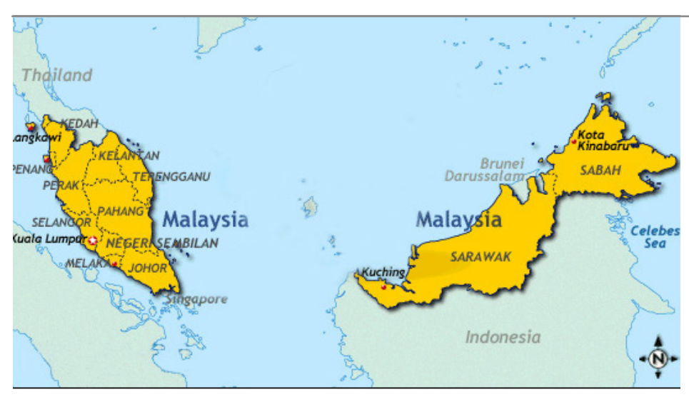
Figure 18. The Malaysian state of Sarawak, highlighted inred in this map, is located in East Malaysia on the island of Borneo, bordered by Indonesia in the south. Its capital city, Kuching, is located in the southwestern corner of the state. © Malaysia Maps. All rights reserved. This content is excluded from our Creative Commons license. For more information, see <a href="https://ocw.mit.edu/help/faq-fair-use/">https://ocw.mit.edu/help/faq-fair-use/</a>.

Sarawak is one of two Malaysian states located on the island of Borneo in East Malaysia. It is bordered by the Malaysian state of Sabah and the nation state of Brunei in the north and the Indonesian region of Kalimantan to the south. Kuching, the capital city, has a population of 700,000. Sarawak is home to more than 40 sub-ethnic groups, with indigenous Ibans making up the majority, or 30%, of the population.