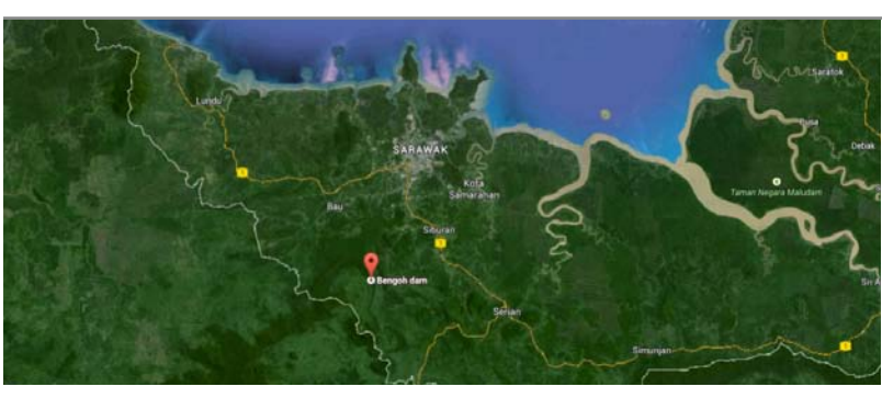
Bengoh Dam, just southwest of Kuching city center (the area labeled "SARAWAK"). KampungRejoi is located six miles away from Bengoh Dam, only accessible by foot.

Forced displacement as a product of economic development is a common story in the interior of East Malaysia. Anticipating the flooding that is part of dam creation, Kampung Rejoi and other nearby villagers were offered government-sponsored resettlement allowances. This involved a nominal sum in exchange for land rights. In the new settlement, the villagers were offered a small parcel of land and a subsidized house connected to municipal utilities. From the villagers' point of view, the relocation plan was problematic because it meant ending up with substantially less land. The village currently occupies 2600 acres. Only some families accepted the relocation plan, which offered a 3-acre plot to each participating family.