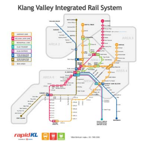
Figure 11.A transit map of Kuala Lumpur highlighting the train stations that correspond with the neighborhoods highlighted in previous map. © Prasarana Malaysia Berhad. All rights reserved. This content is excluded from our Creative Commons license. For more information, see https://ocw.mit.edu/help/faq-fair-use/.

should be two categories of people included in the study: people who use transit regularly and people who use private vehicles as their primary or exclusive means of travel. Within those groups, the researcher may choose to use a random sampling method or a purposeful sampling method (e.g. men and women, even distribution of ages, etc.), and can use techniques like intercept interviews, which entail stopping people on the street and asking people if they want to participate. The research assistant should help format questions for clarity, identify suitable locations for on-the-ground research, and translate responses prior to analysis. The researcher might also want to arrange more formal interviews through the contacts listed below in "Potential resources."