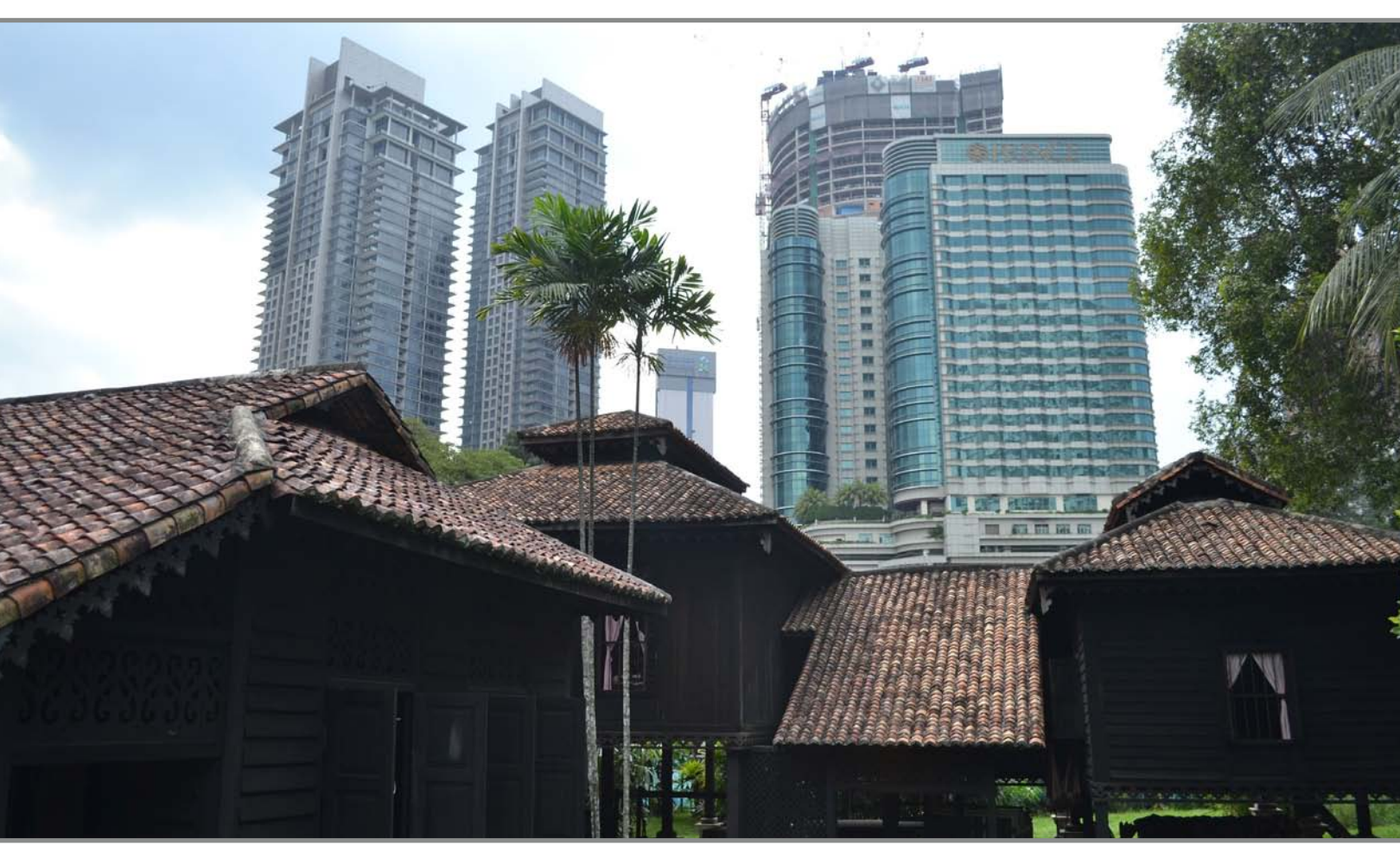
Figure 1. Traditional Malay house contrasted with high-rise development in Kuala Lumpur.