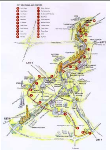
Figure 10.Central Kuala Lumpur showing tran-Sit lines and potential study neighborhoods. © KLIA. All rights reserved. This content is excluded from our Creative Commons license. For more information, see https://ocw.mit.edu/help/faq-fair-use/

For non-Malaysian scholars, working closely with a research assistant who is skilled in transitioning between English and Bahasa Malaysia is likely the key to successful in-person interviews and written or oral surveys. There