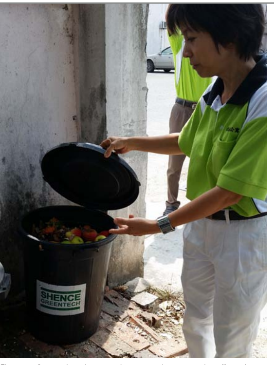
Figure 15.Community volunteer points to ongoing composting efforts that began under a UNEP/World Bank output-based aid separation at source pilot project. Photo by Matthew Willner, 2015.

In 2008, when the DAP won control of Penang, the new government applied for, and was granted, an exemption from the National Solid Waste and Public Cleansing Management Corporation Act, which favored the privatization of solid waste management services. Since then, the DAP-led state government and municipal councils have worked to design their own solid waste system. While the state government orchestrated Penang's independence from the federal government on solid waste management, the municipal governments now handle the task differently, in that the island contracts out waste collection services while the mainland directly manages collection. These differences, coupled with several interventions by international financial institutions and international organizations, have led to the layered and experimental system of solid waste management that exists in Penang today.