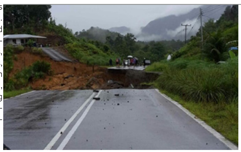
ary 2015 floods have noted that all forms of mobility were Post. All rights reserved. This content is excluded from our Creative Commons license. For more information, see http://ocw.mit.edu/help/faq-fair-use/

Observers in and near Kuching, Sarawak during the Janu-