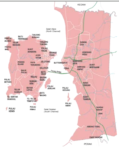
Figure 14. Penang, a state on the northwestern coast of Peninsular Malaysia, includes Penang Island and SeberangPri on the Malay Peninsula.

© myMaloysiabooks.com. All rights reserved. This content is excluded from our Creative Commons license. For more information, see https://ocw.mit.edu/help/faq-fair-use/.