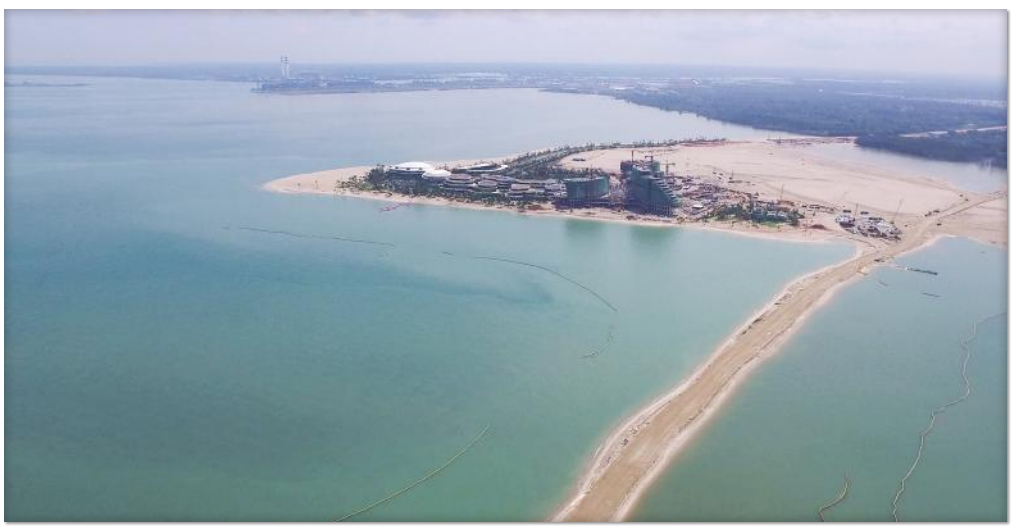
Figure 34 . An aerial view of the Forest City development on reclaimed land, Johor Bahru. Photo Credit: Marcel Williams, 2017.