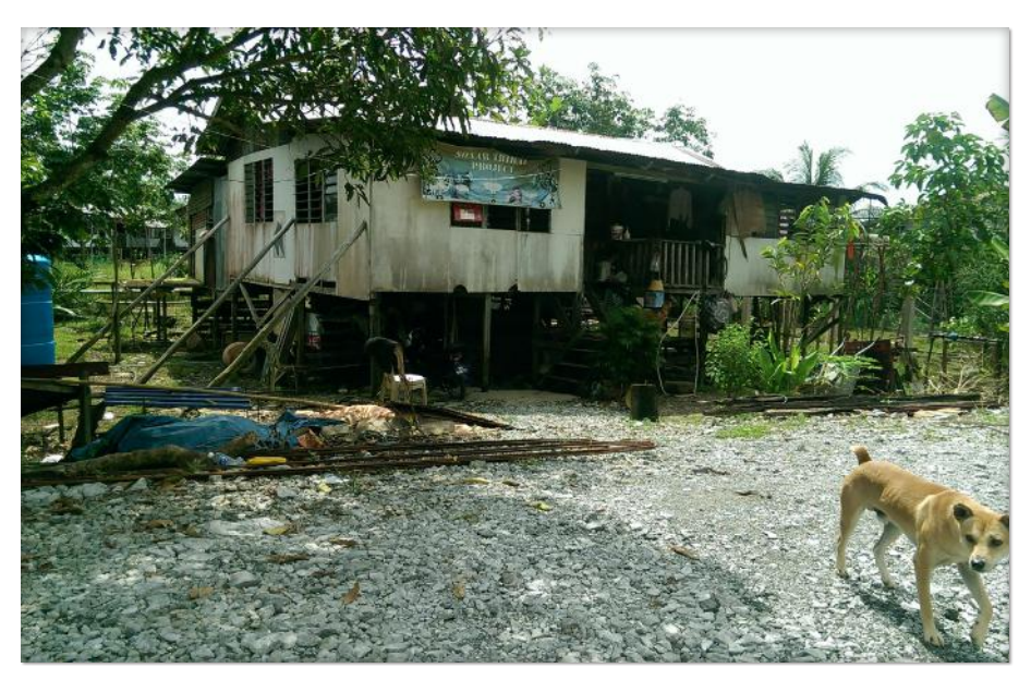
Figure 29. Example of informal housing in Batu Kawa.

How does rural—urban migration affect the legal rights and social vulnerability of indigenous groups?