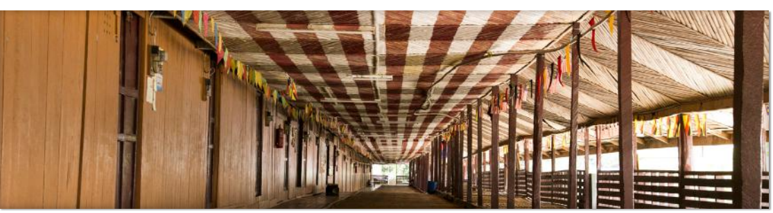
Figure 28. A rural village in Sarawak.

Sarawak is one of two Malaysian states located on the island of Borneo in East Malaysia. It is bordered by the Malaysian state of Sabah and the nation-state of Brunei in the northeast and the Indonesian region of Kalimantan to the south. As of 2015, Sarawak's population was 2.6 million people, spanning over 40 sub-ethnic groups. Over 50% of the population is made up of indigenous groups including Iban, Bidayuh, Melanau, and Orang Ulu. Kuching, the capital city, has a population of 600,000.