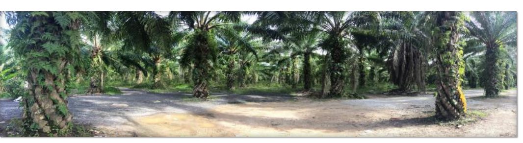
Figure 10. Oil palm trees in Raub.

Pahang is the third largest state by land area in Malaysia and the largest in Peninsular Malaysia with a surface area of \sim 36 thousand square kilometers. In 2015, Pahang had a population of 1.623 million people, making it the 9th most populous state in Malaysia. Its state capital, Kuantan, is the 9th largest city in Malaysia with a population of approximately 608,000 in 2010. Northwest Pahang is home to three districts: Cameron Highlands, Lipis, and Raub, with populations of \sim 40,000, \sim 20,000, and \sim 80,000 people respectively. The economy of these districts, along with most of the state, relies largely on agriculture and extractive industries, with tourism especially prevalent in the temperate highlands.