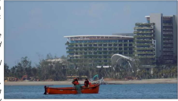
Figure 35. Some local fishermen in Johor Bahru feel they have not been adequately included in development decisions.