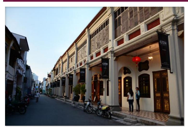
Figure 26. A recently renovated boutique hotel consisting of a row of former shop houses, across the street from residential units.

What are the overall trends driving the housing affordability gap in Penang Island and what dynamics are unique to George Town