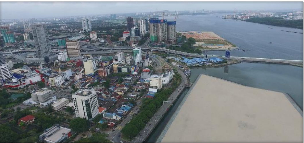
Figure 6. Downtown Johor Bahru, featuring the Princess Cove real estate development, newly reclaimed land in the Johor Strait, and the causeway to Singapore. Photo credit: Griffin Smith/Sam Barnard, 2017.

Located at the southernmost tip of peninsular Malaysia, Johor Bahru (JB), the capital city of Johor state, sits just across from Singapore. Thus, it is a common entry point into Malaysia for tourists and businesspeople. JB is becoming increasingly attractive as an affordable alternative to more expensive Singapore. Johor's proximity to and interconnectedness with its wealthy neighbor generates a variety of transboundary issues related to water provision, environmental protection, and shipping channel access. These issues require management by local and regional entities,. In addition to these international challenges, Johor must increasingly contend with domestic cross-jurisdictional resource management questions. Johor is both negotiating a water supply agreement with northern neighbor state, Malacca, and arranging the water supply and other infrastructure for numerous, emerging, large-scale real estate projects within the state.