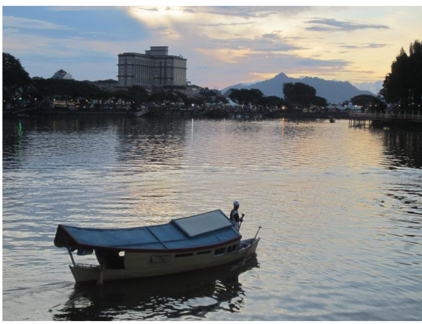
Figure 33. Sampan boat on the Sungai Sarawak, Kuching.

How have commercial and industrial uses of the Sungai Sarawak evolved over time, and which uses have been encouraged or discouraged by state officials and riverfront development schemes?