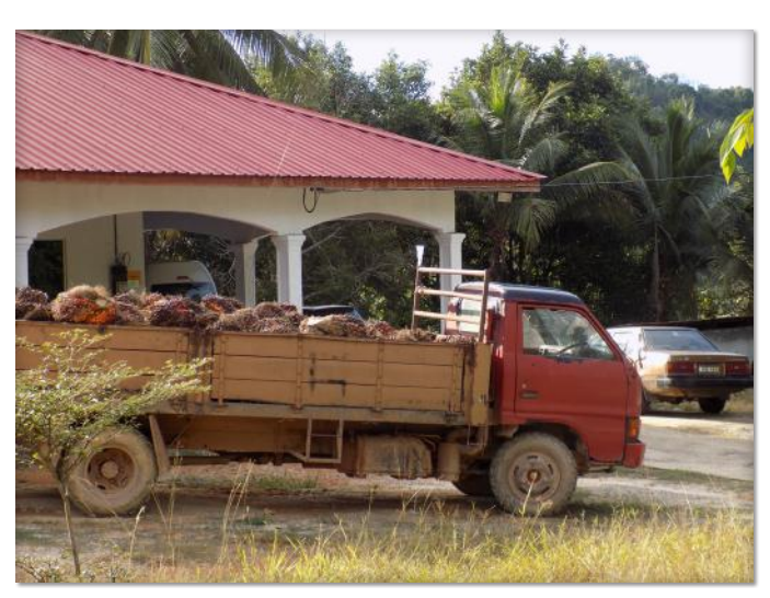
Figure 12. Oil palm truck at FELDA Krau, Raub.