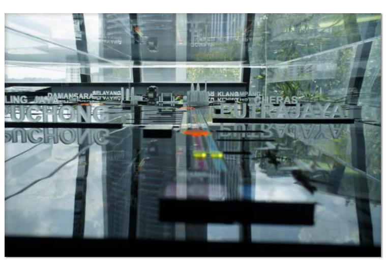
Figure 4. Kuala Lumpur MRT model.

Malaysia has witnessed an explosive rise in the demand for transport in recent decades in conjunction with its rapid economic growth. The country is heavily dependent on private vehicles, especially in Kuala Lumpur (KL). In the Klang Valley, the region in KL with the highest rate of vehicle ownership, there are 6 million people, 11 million cars, and 9 million motorcycles. The average