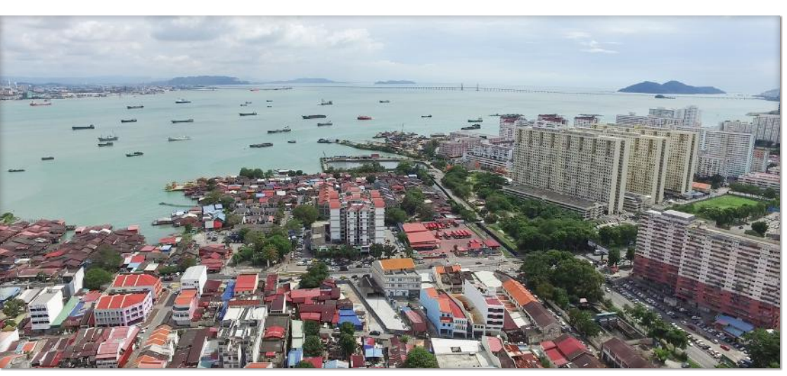
Figure 17. Aerial view of George Town, Penang towards the Strait of Malacca, Photo credit: Marcel Williams, 2017

Penang state, one of the most urbanized and economically developed states in the country, is divided between Penang Island and Sebarang Perai (the mainland), with each governed by its own municipal council. The state is ethnically and racially diverse, with 41.7% ethnic Chinese, 41.3% Malay, and 9.8% Indian Malaysian. The state's economy is heavily based on semiconductor and electronics manufacturing, while fishing has also historically been an important activity, leading some to refer to Penang as a "fish and [computer] chips" capital. However, some Penangites have raised concerns about recent declines in those two sectors. Tourism is a more recent industry, driven in part by George Town's UNESCO World Heritage Site designation in 2008.