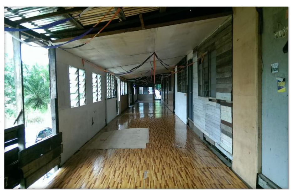
Figure 30. Informally built longhouse in Batu Kawa. Photo Credit: Francis Goyes, 2017.

This research would take the form of a case study of rural-to-urban Dayak migration. Through interviews with Batu Kawa families and mapping exercises, the scholar could broaden understanding of Dayak migration patterns in the region as well as the economic opportunities they have found in the city. The scholar should identify one or two more Dayak migrant communities in Kuching to develop a comparative study. A second phase of the research would develop a place-specific social vulnerability index, such as the Eviction Impact Assessment tool or Cutter's Social Vulnerability Framework, which can be administered to Batu Kawa residents and other identified migrant settlements in Kuching to assess how rural-to-urban migration has affected migrant's vulnerability.