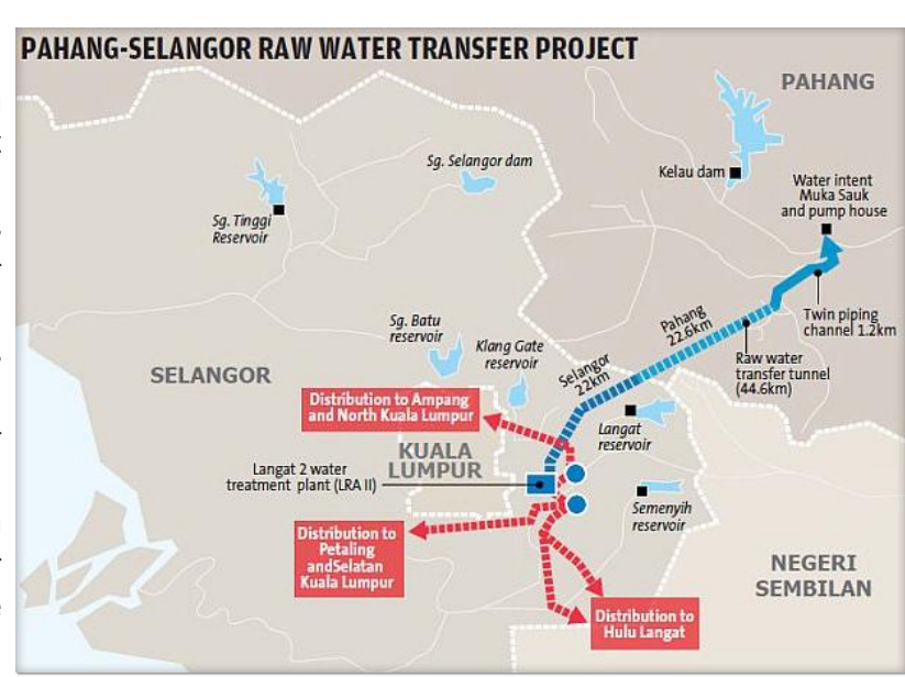
Figure 16. Map of the water transfer project and its attendant structures.

The Japan International Cooperation Agency financed the RM2.48bn project which included the construction of the 35m-high Kelau Dam, a water treatment plant called Langat 2, a pumping station, dual water pipelines, access roads, and a telemetry system. This tunnel and its attendant structures will supply raw water from the River Semantan, a tributary of the Pahang River, to Selangor, Kuala Lumpur, and Negeri Sembilan. The pipeline's excavation was completed in 2014 and the Langat 2 water treatment plant is scheduled to be online in October 2017 at the earliest. With the project's completion near, raw water from the Semantan River has already been transferred to the Langat River, with the first flow of water through the tunnel occurring in August 2015 after the Sungai Langat Dam experienced low capacity.