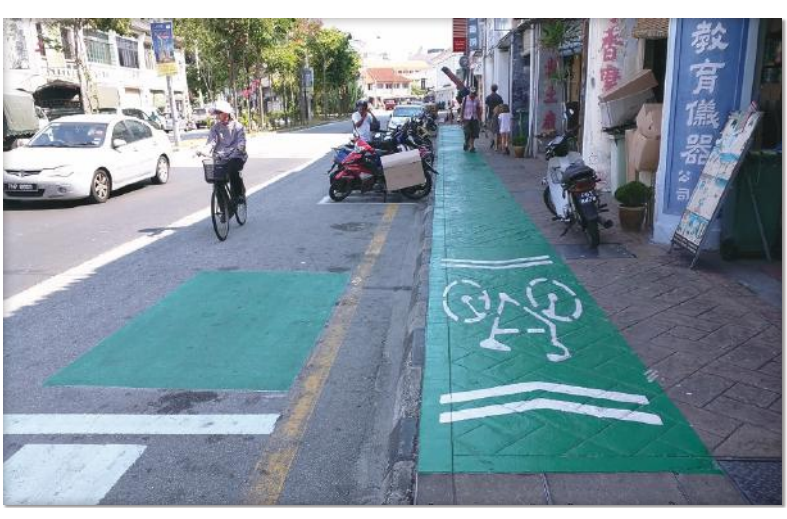
Figure 24. A bi-directional bicycle lane, painted green, was recently implemented in George Town. Photo credit: Phil Tinn. 2016

A scholar can look at aggregate travel demand data including modal splits over time, motorization rates (cars per household), and estimates of regional vehicle-kilometres traveled (VKT). Gauge public opinion for transportation Figure 25. RapidPenang bus in rush-hour traffic congestion in George Town. Photo credit: Nick Cohen, 2017. interventions through surveys, such as onboard transit