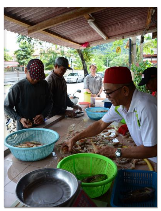
and shrimp, valued at several hundred ringgits.

Coastal land reclamation raises questions about previous impacts to, current conditions of, and future implications for fisheries in Penang. Several environmentalists argued that an economic analysis would help inform a more accurate Cost-Benefit Analysis of the proposed reclamation in the south. In addition, villagers in the south indicated that fishermen from the mainland could also be affected. Therefore, this analysis would help explore appropriate boundaries of a cost-benefit analysis. This research would also have broader implications for coastal land reclamation projects throughout Malaysia Figure 21. Leader of fishing co-op weighs daily catch of fish and the region.