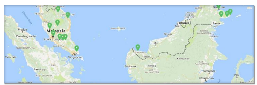
Figure 13. Location of FELDA Oil Palm Factories in Malaysia.

What are the economic, policy, and technological factors that impede oil palm mills from using their biological waste as renewable energy sources?