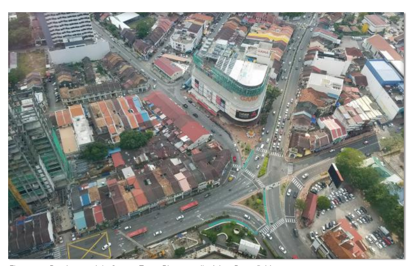
Figure 22. Road network in George Town.

How have non-traditional financing mechanisms such as land reclamation been used in the provision of transportation infrastructure in Penang?