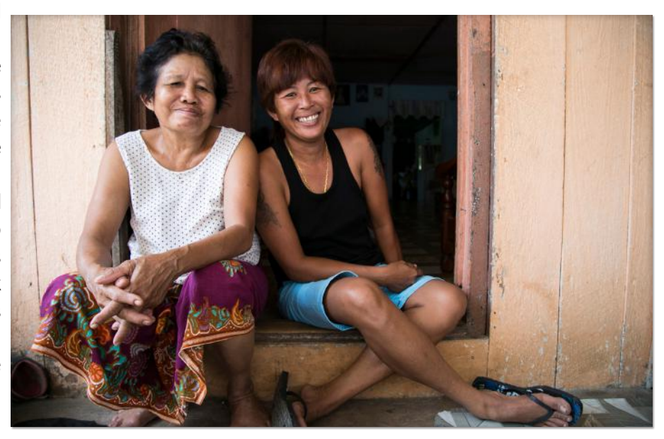
these dynamics may inform alternative models for Figure 31. Bidayuk women reflecting on history of the village and relationship with palm oil industry. Photo Credit: Rebecca accepts urising to maximize social impact. Hui, 2017.

in community sustenance by measuring financial returns and qualitative feedback from selected communities. For instance, if an eco-tourist site is controlled by external actors, perhaps there is higher immediate return on investment, but the returns over time are less. Or alternatively, a more communally owned model has slower returns, but exhibits greater community agency and sustainability. In some cases, the tourist's desire to see culture can influence the villagers' behaviors by encouraging them to perform more. A feedback loop may emerge, with increasing disingenuous behavior from both sides. With further discovery of the place, consumers may cease to find the place as novel, and villagers may adopt behaviors based on what tourists may want to see. An analysis of ecotourism to maximize social impact.