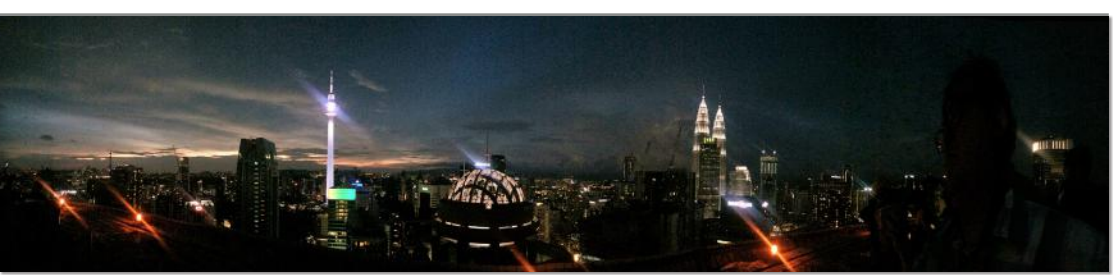
Figure 2. View of the skyline from the top of Menera KH, Photo credit: Yiling Xie, 2017.

Kuala Lumpur is the largest city and the preeminent economic and cultural center of Malaysia. Seated at the heart of a 6.9 million person metropolitan area, the city is a nexus of rapid development and modernization. The government aims to make greater KL and the surrounding Klang Valley one of the top 20 most livable cities by 2020. Planners and policymakers are also striving to establish Kuala Lumpur as a "World Class City." Their efforts include billion-ringgit projects, such as the Mass Rapid Transit(MRT), a 'river of life' project to revive Sungai Klang and Sungai Gombak; fighting against street crime; and achieving success in attracting multinationals. However, some ongoing projects are at times in tension with resident lifestyles within the many kampungs, traditional Malay villages that have amalgamated over time to constitute the city.