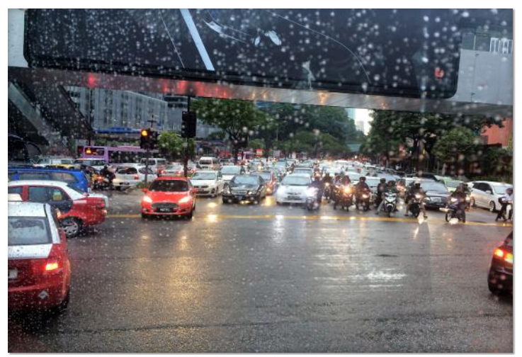
Figure 3. Peak traffic congestion in Kuala Lumpur.

How can new sources of data be used to help planners mitigate congestion throughout Kuala Lumpur?