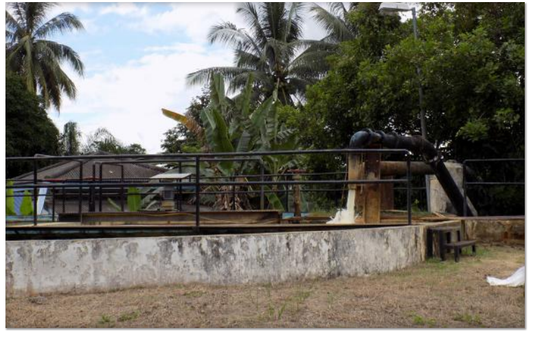
Figure 37 . Drinking water treatment plant in Raub, Pahang. Pahang transfers drinking water to Selangor.