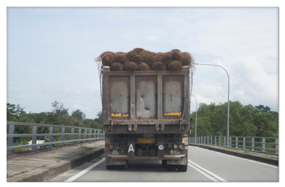
Figure 32. Truck carrying palm oil on AH-150 highway.