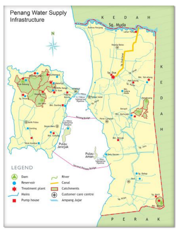
Figure 19. Penang Water Supply Infrastructure Map.

• PBAPP documents in MSCP Research Library