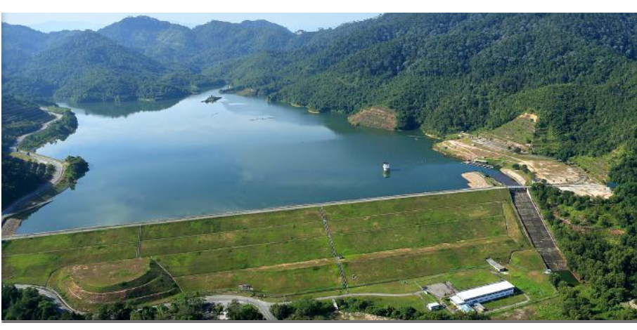
extremely dependent on Kedah, as 84% of its Figure 18. With a maximum capacity of 18.24 billion liters, Penang's Teluk Bahang Dam serves as an important "strategic raw water comes from the Sungai Muda The two drought reserve dam."

The Penang Water Supply Corporation (PBAPP), the water operator for Penang state, has the lowest domestic water tariff and non revenue water (NRW) (19.9%) in the country. Penang is also the only state in Malaysia not to ration its water use, as ensuring uninterrupted water supply is considered particularly important for the success of the state's electronic manufacturing sector. Despite achievements in water provision, Penang faces several challenges around water security. First, it is extremely dependent on Kedah, as 84% of its raw water comes from the Sungai Muda. The two states' water demand is expected to exceed the supply from the Sungai Muda by 2020. Second,