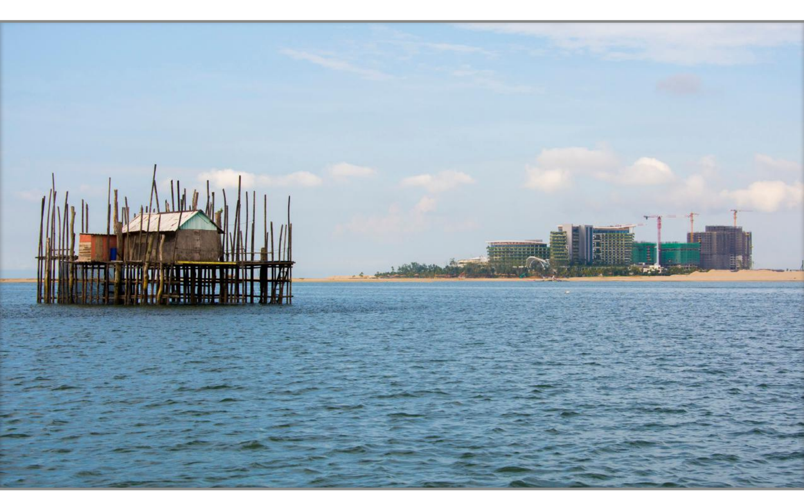
Figure 1. An offshore fishing post alongside the Forest City development on reclaimed land in the Strait of Johor, Photo Credit: Sera Tolqay, 2017