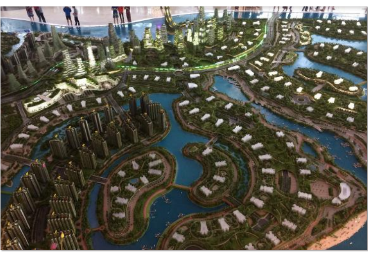
Figure 7. Scale model of the first of four planned islands in the Forest City development, Country Garden marketing suite, Johor.

While proponents of these projects promise major economic benefits to the region, their sheer scale, speed, and apparent lack of inclusion in regional plans raises concerns. Prominent among these are questions about the feasibility of and responsibility for the provision of basic infrastructure services to the new projects, the largest of which, Forest City, aims to attract 700,000 new residents alone. Many of the units under construction are classified as commercial service apartments rather than residential, meaning that, under Malaysian law, the developer is not always responsible for providing basic public amenities (such as water and sewage infrastructure) for them. It remains to be seen to what extent this classification will place an undue burden on utilities and service agencies.