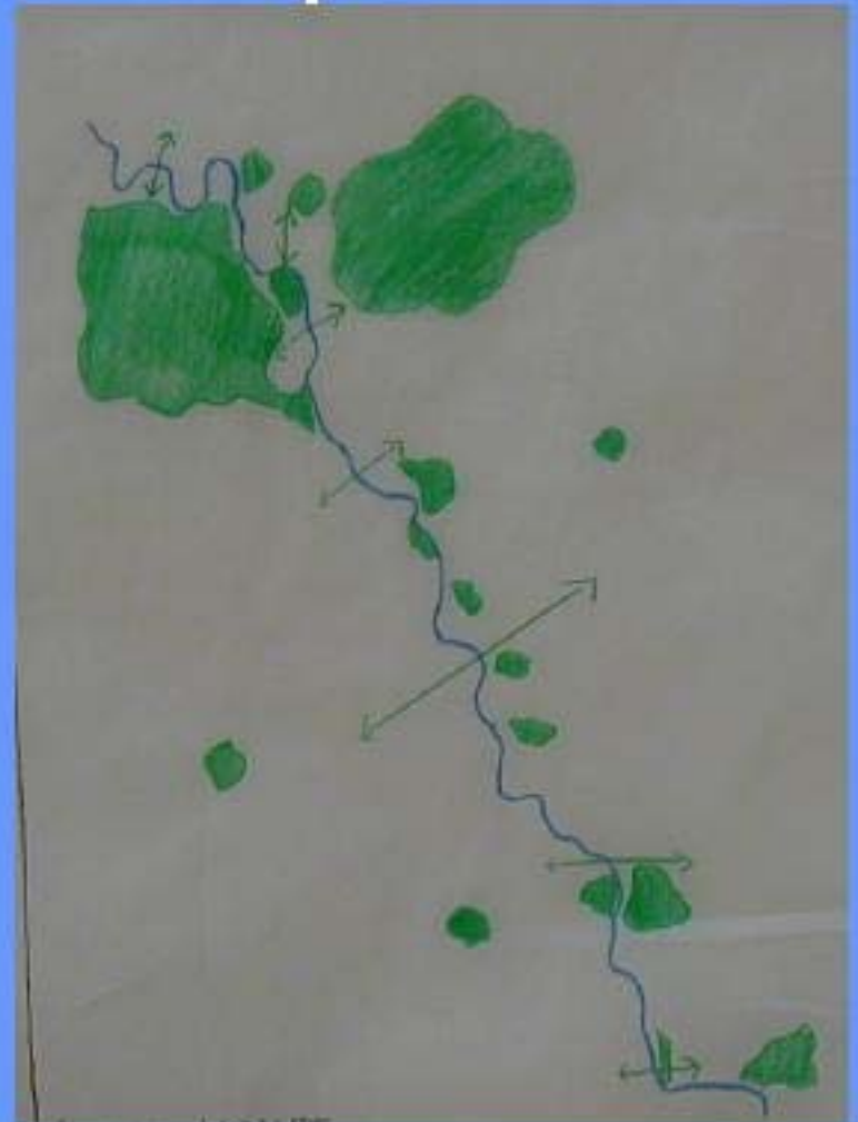
CARDENER RIVER CORRIDOR DEVELOPMENT