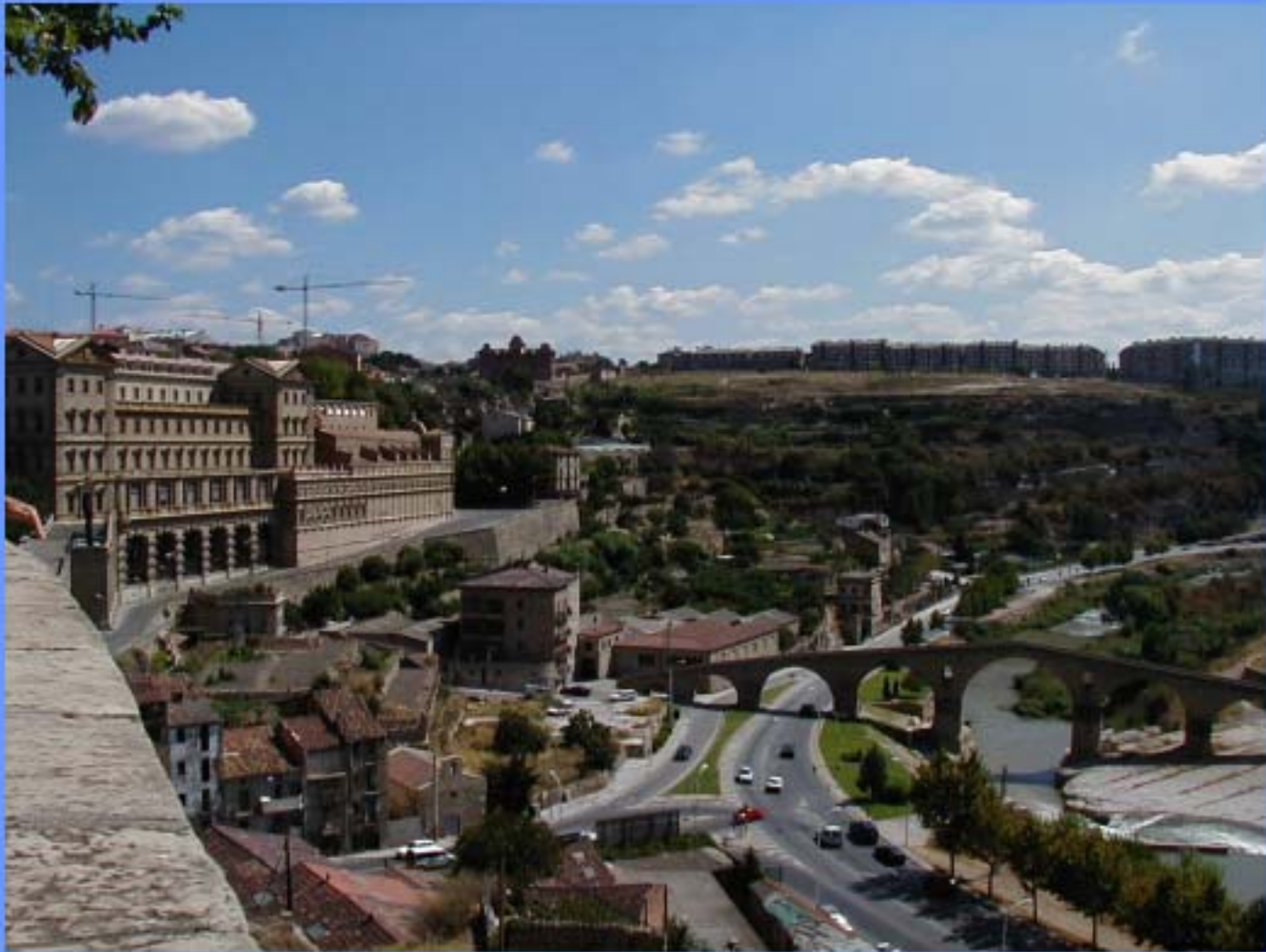
CARDENER RIVER CORRIDOR DEVELOPMENT