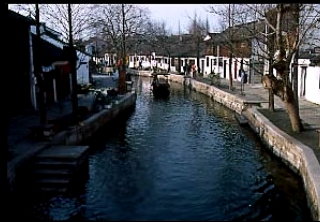
Zhu Jia Jiao